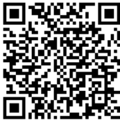
Follow QR code to the YouTube Video

New Evangelization Television (NET) recently featured a video and blog about St. Christopher’s Inn on their website. Hear the moving stories of the men seeking healing.